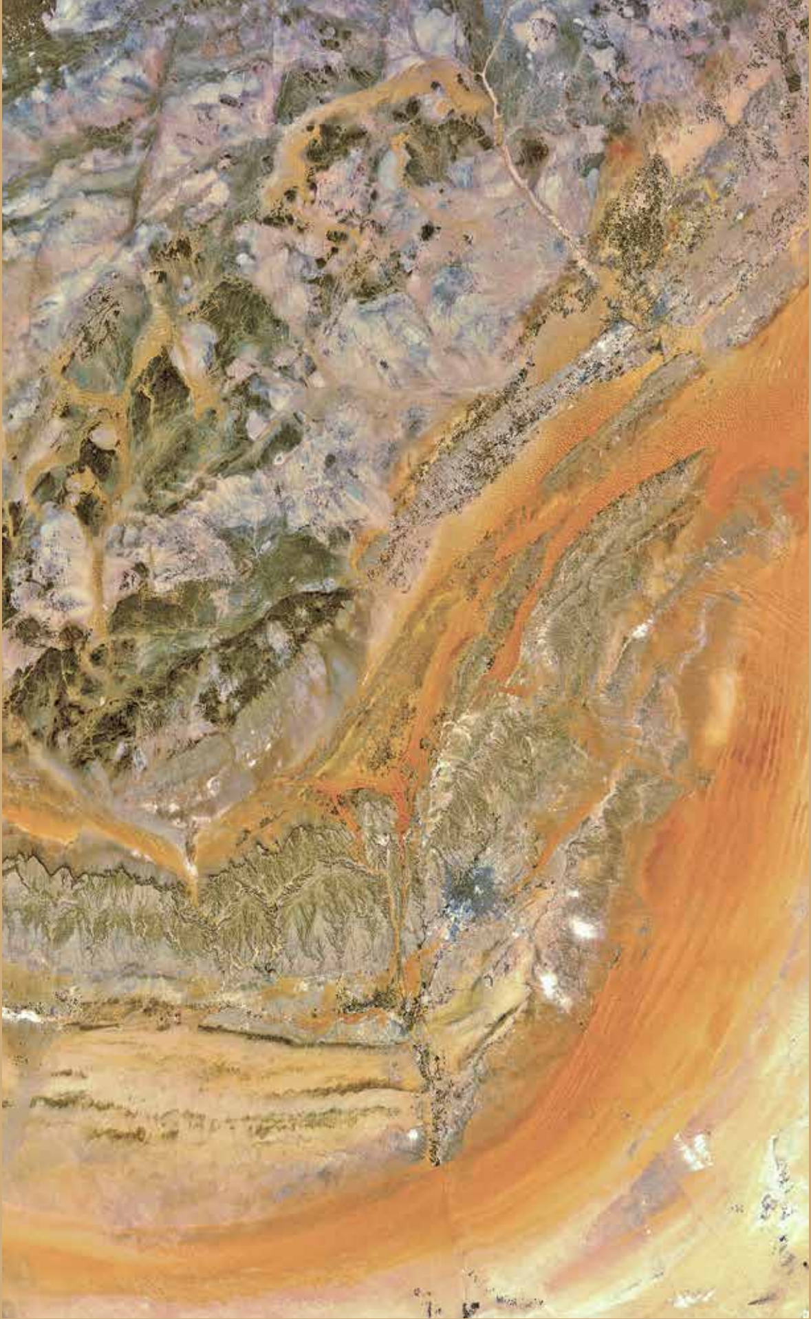
NEJD, SAUDI ARABIA