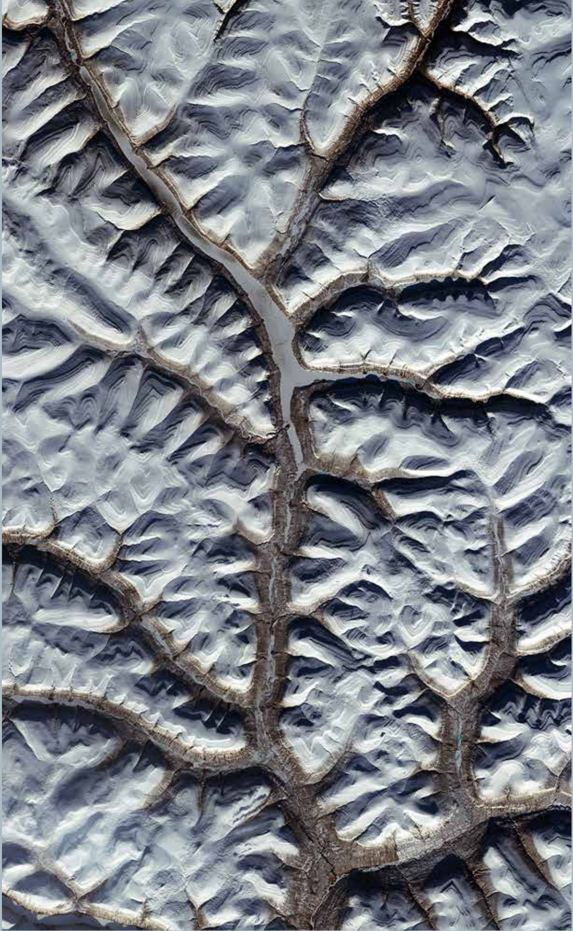
PUTORANA PLATEAU - SIBERIA | © Contains modified Copernicus Sentinel data (2016), processed by ESA, CC BY-SA 3.0 IGO