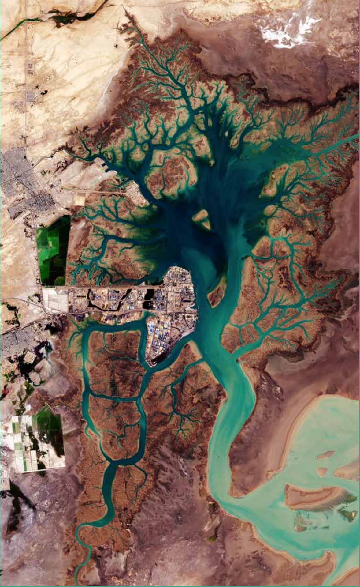
MUSA BAY , IRAN