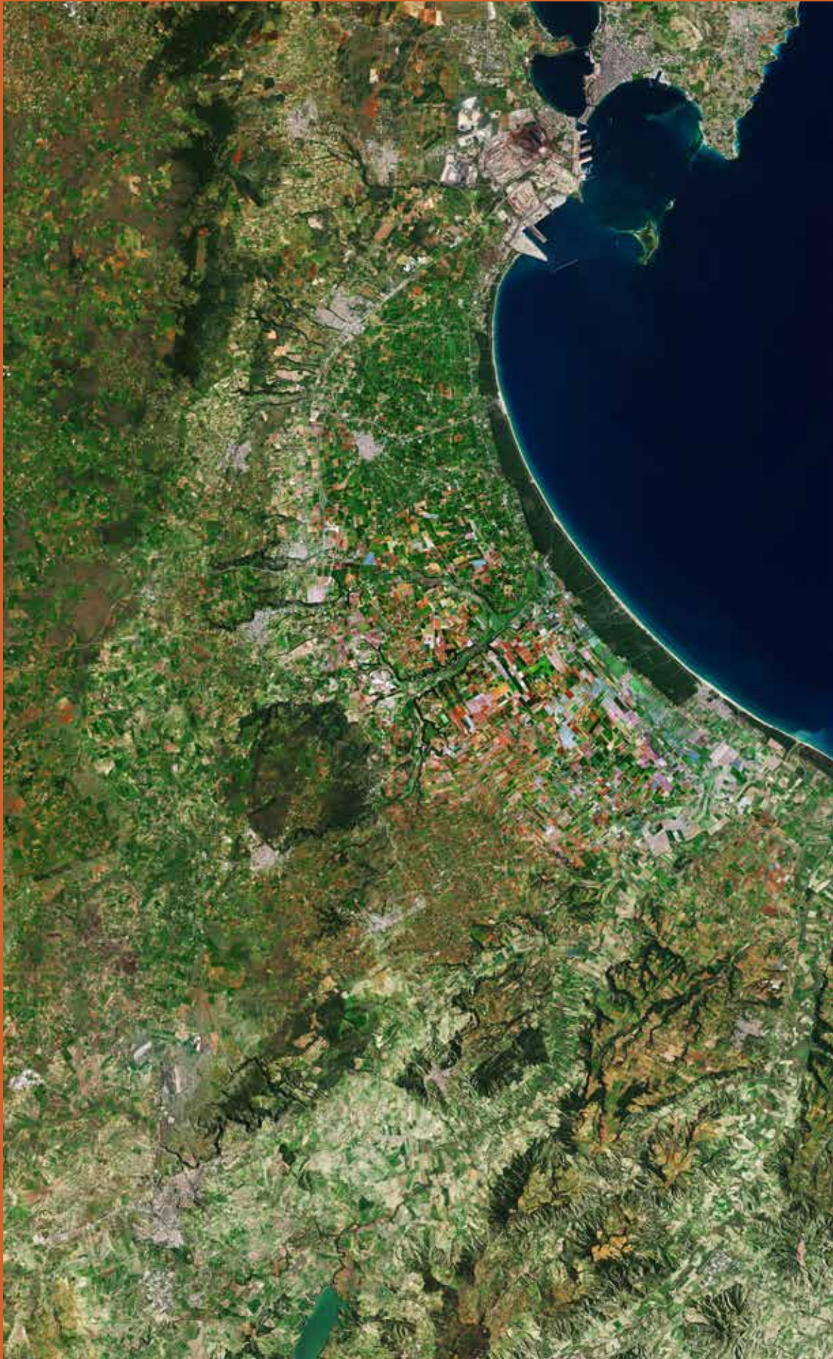
TARANTO, MATERA - ITALY