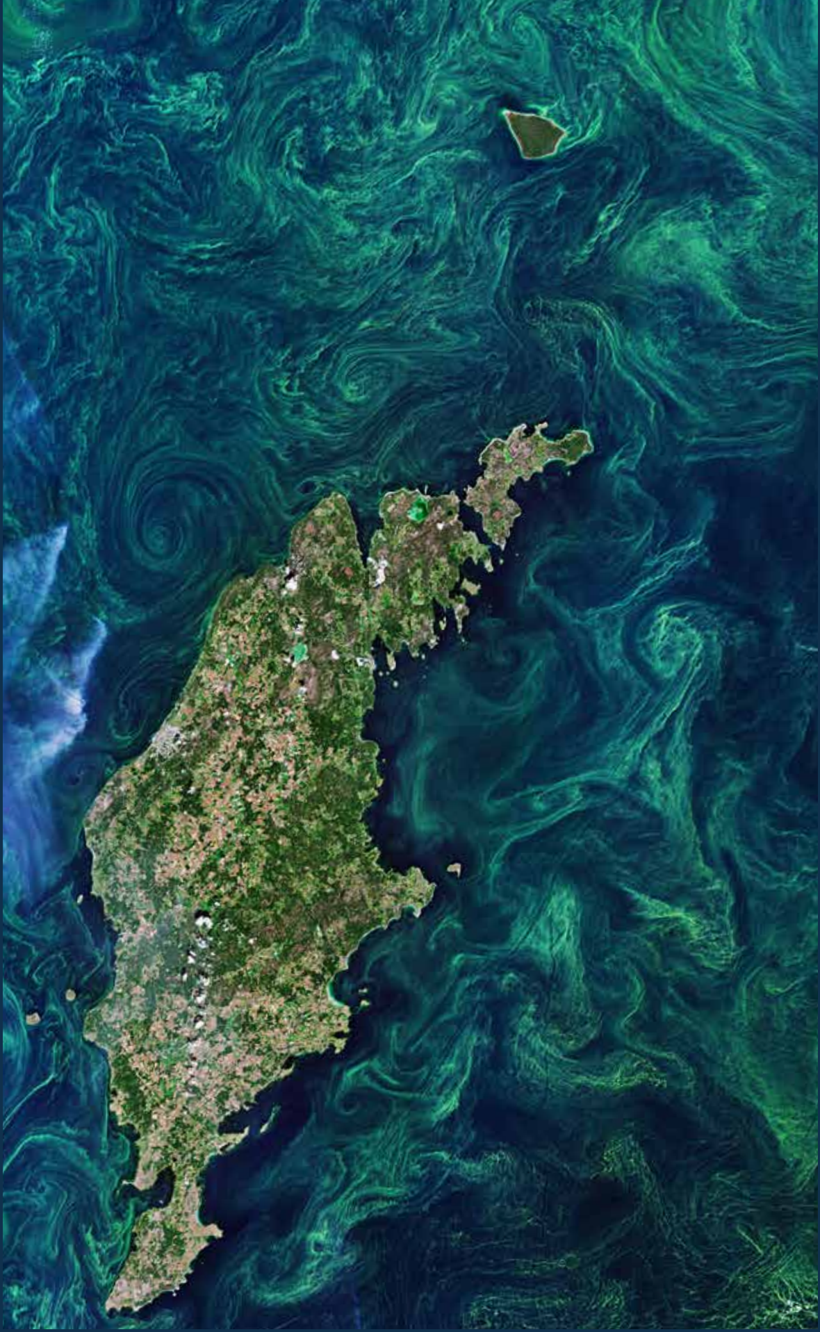
GOTLAND, SWEDEN | © contains modified Copernicus Sentinel data (2019), processed by ESA, CC BY-SA 3.0 IGO