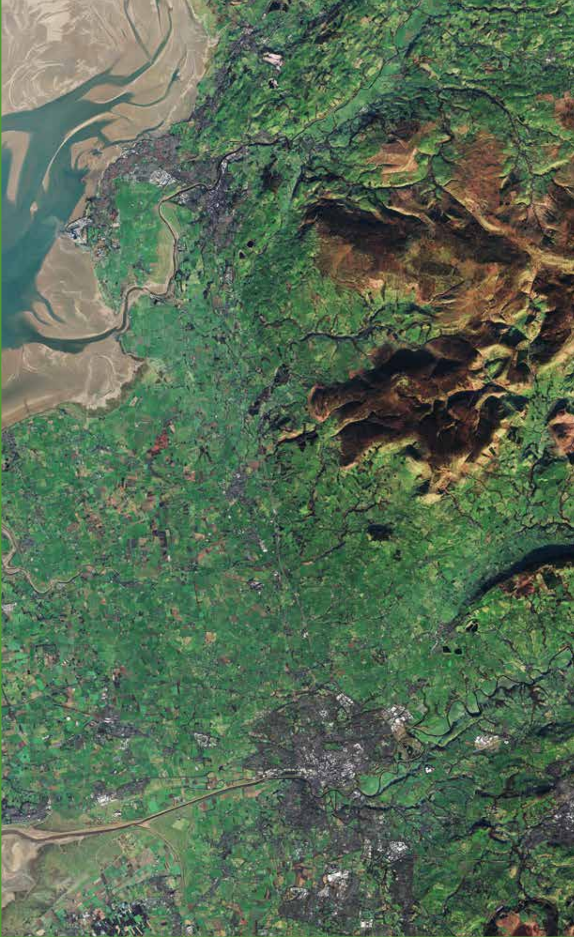
PRESTON, YORKSHIRE - UK