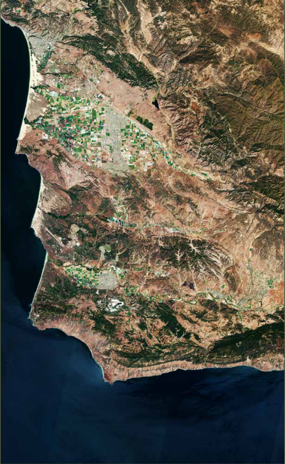
CALIFORNIA | © contains modified Copernicus Sentinel1 data (2020), processed by ESA, CC BY-SA 3.0 IGO