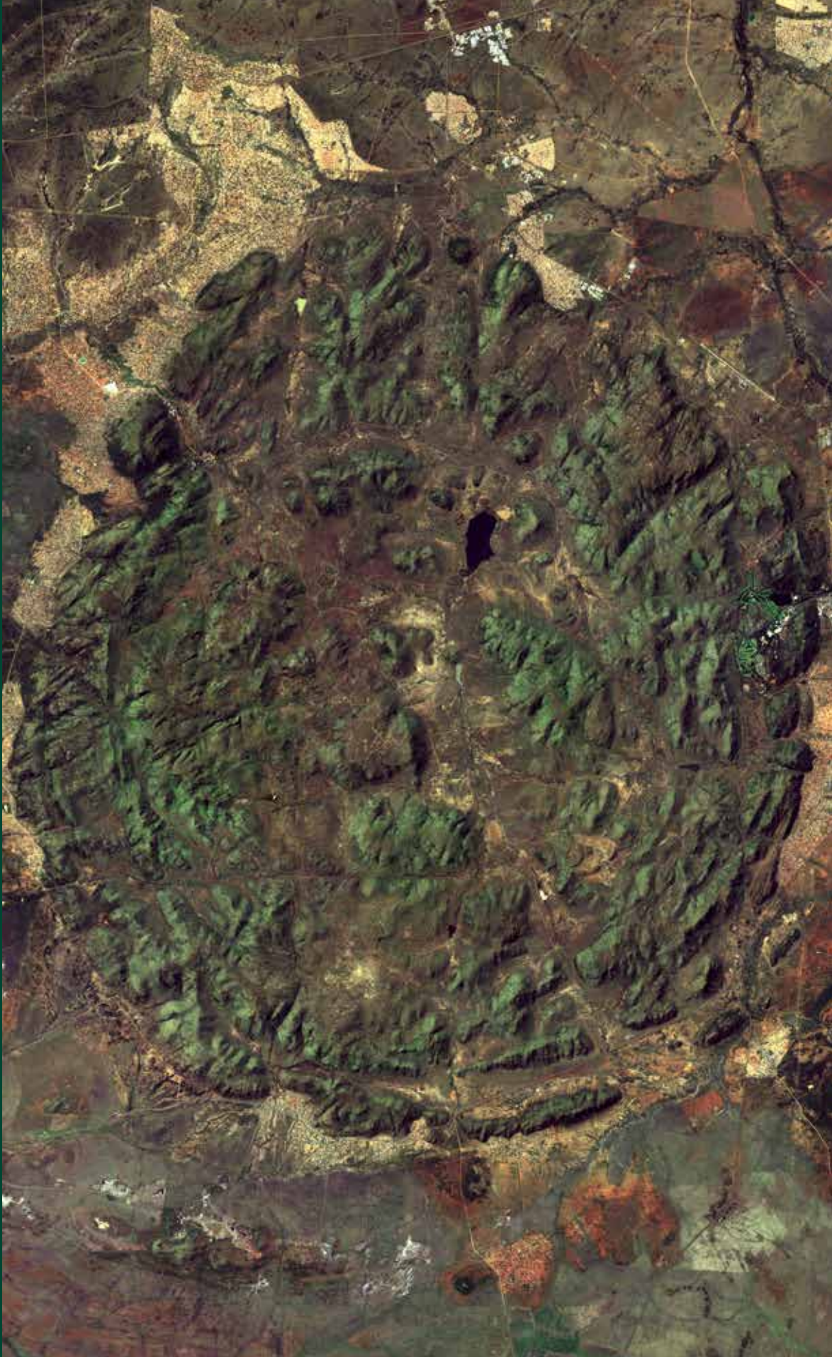
PILANESBERG - SOUTH AFRICA 100