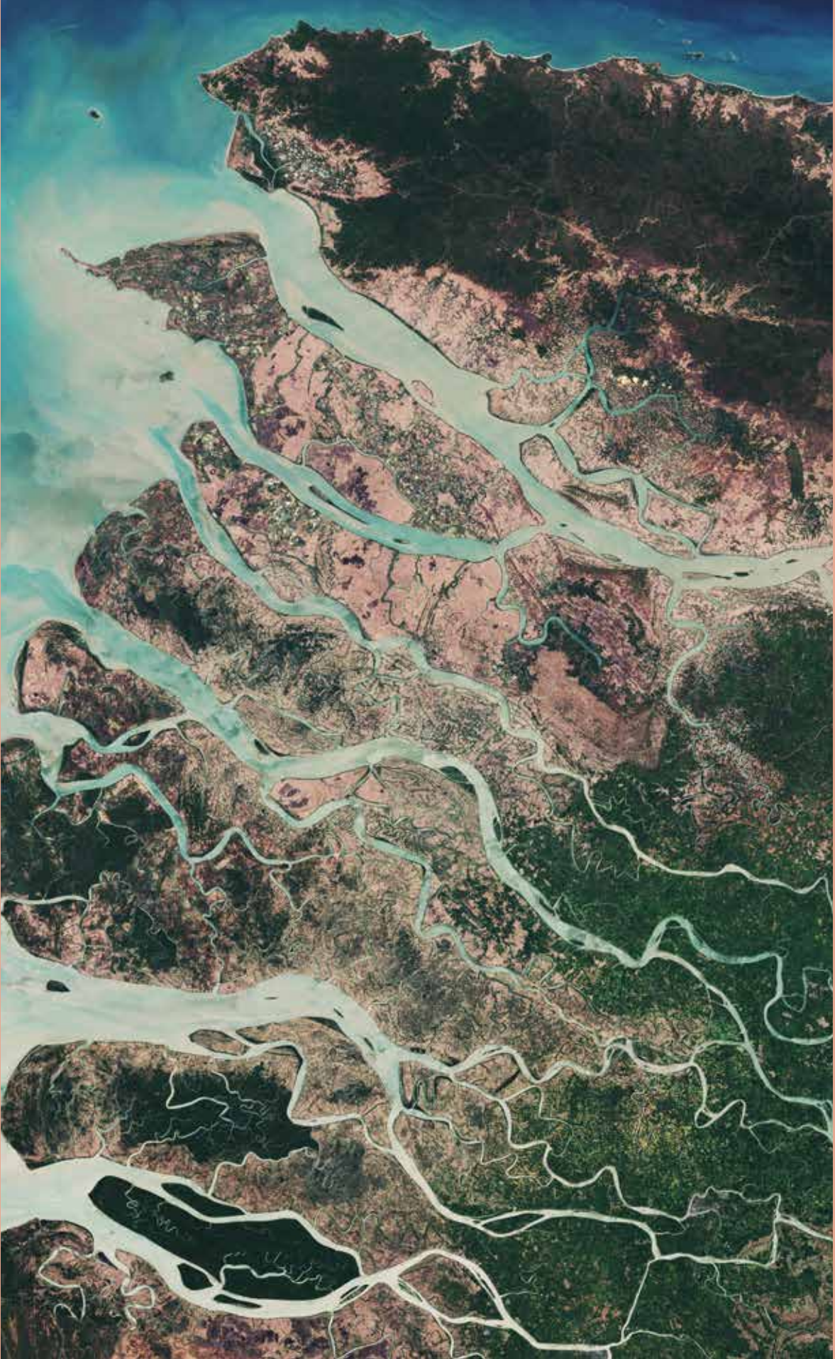
IRRAWADDY DELTA - MYANMAR | © contains modified Copernicus Sentinel data (2017), processed by ESA, CC BY-SA 3.0 IGO